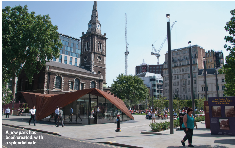
A new park has been created, with a splendid cafe