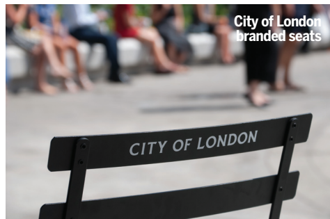
City of London branded seats