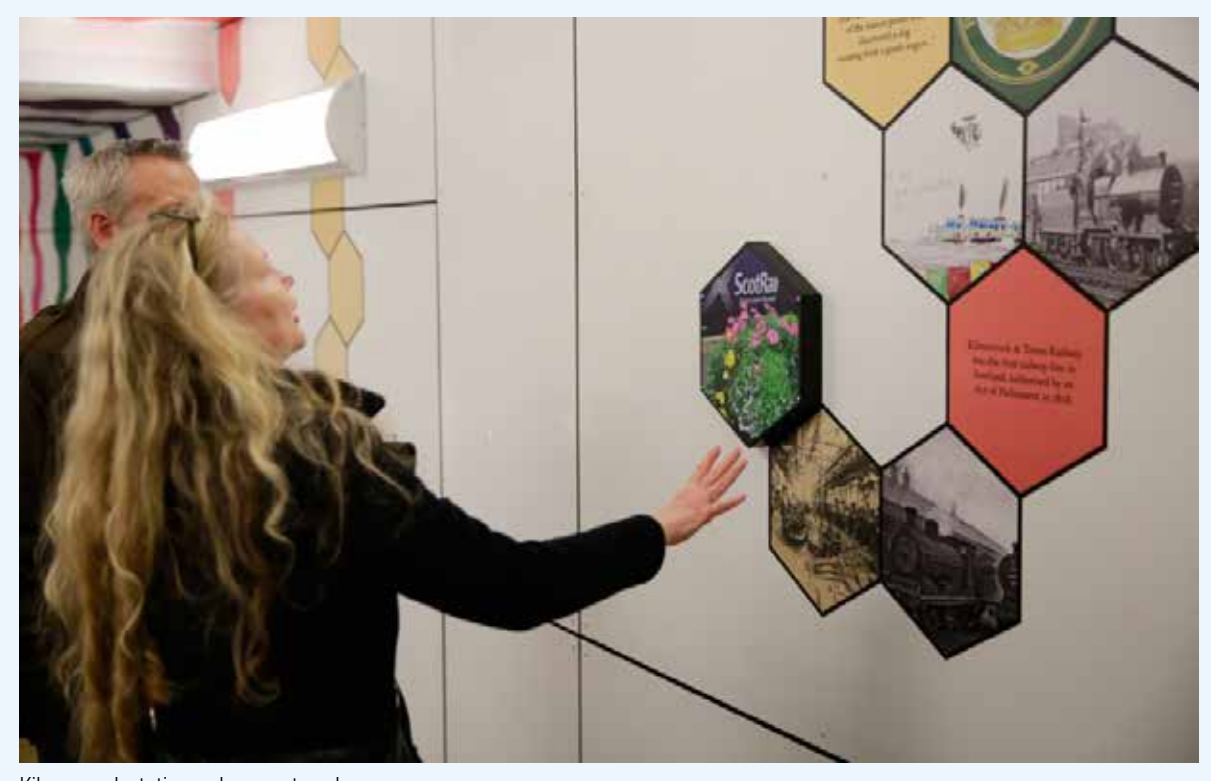
Kilmarnock station subway artwork

The redevelopment reflects the identity of the town it serves – improvements to the station's subway involved artwork based on community, school and college workshops, which encouraged people to bring a drawing, story or anecdote that connects to, or says something about Kilmarnock<sup>24</sup>.