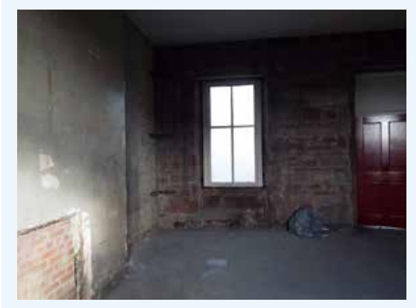
Kilmarnock Station before restoration.