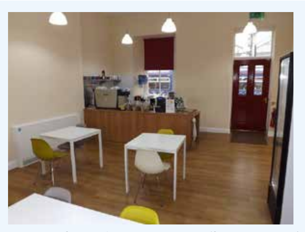
Kilmarnock Station after redevelopment as 'Storm in a Teacup' Cafe.