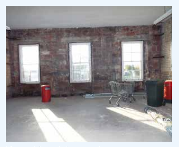
Kilmarnock Station before restoration.

The trust secured £500,000 funding from a number of sources and bought seven station rooms back into use. The station rooms now host a gift shop; coffee shop – 'Storm in a Teacup'; bookshop – 'The Killie Browser', which doubles as an event space; workspaces; meeting rooms; and offices for community groups.